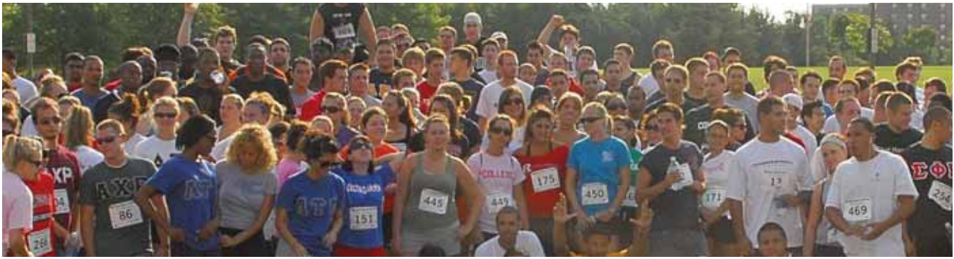
A throng of Rutgers students turns out for High Speed Chase for the Cure.