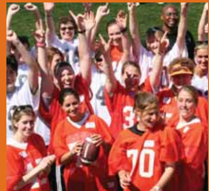
Women take the Princeton University football field against cancer.

We encourage all football widows and female football enthusiasts to learn about the game from collegiate coaches next May at the Princeton University Women's Football Clinic.