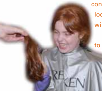
A student expresses the joy of giving!

She adds, “We are pleased to contribute to a local institution with a fine reputation and hope to do it again in three years (when our hair grows back!).”