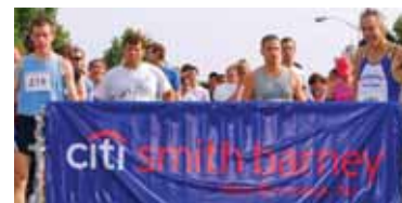
At the starting line for High Speed Chase for the Cure